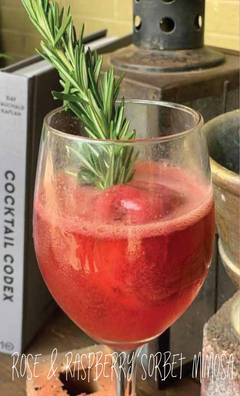
ROSE & RASPBERRY SORBET MIMOSA

WINE WEDNESDAY 1/2 OFF BOTTLES & GLASSES ALL DAY YEAH. YOU READ THAT RIGHT